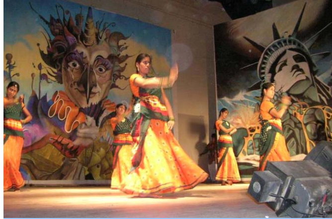
Dance Club – adding colour to Mithali

A confluence of creativity, coherence, imagination and talent, Mithali- 2006 was a huge hit with all the three clubs, Music, Dance and Mime putting their best feet forward. The evening was an expression of brilliance, inspiration, confidence and perfection. An overflowing audi perfectly summarizes the show. People fought for places inside and when the stairs and entrances were also crowded, the rest of them had to retract to FD-2 QT to