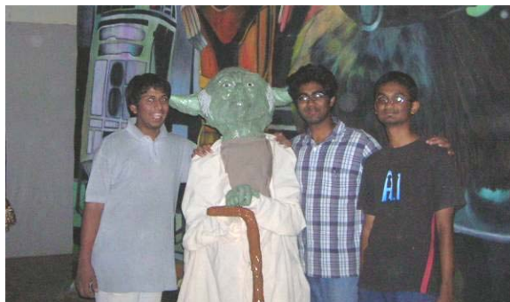
OHT Winners with the Jedi Master, the event mascot