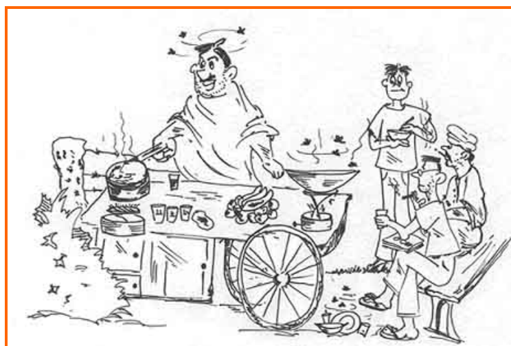
Ratan's By the time one is past the initial scare of the 'mess grub' almost anything else tastes like nectar...even Ratan's desert insects fried inside the samosas or floating in the 'chai'.