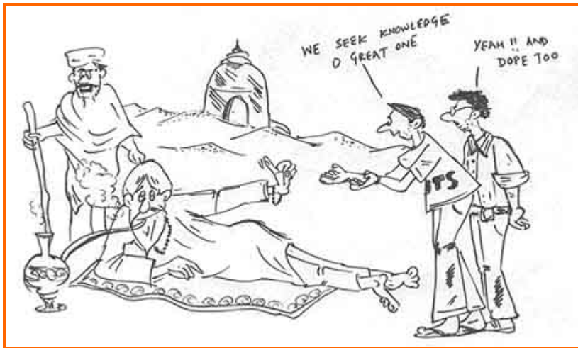
A mysterious location An obscure and mysterious location hidden away in the sands of the desert...a favorite watering hole for the more spiritually inclined